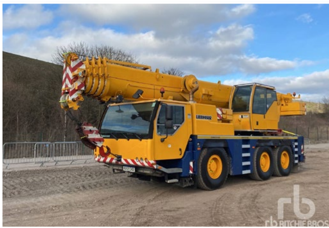
2008 LIEBHERR LTM1055-3.2