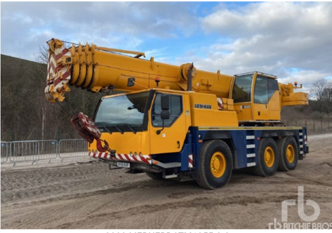
2008 LIEBHERR LTM1055-3.2