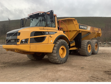
2016 Volvo A30G SOLD FOR: £109,000