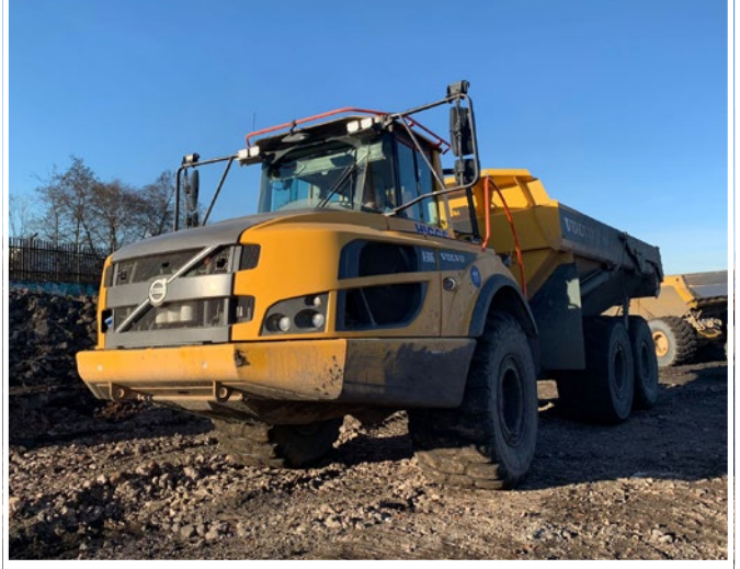
2018 VOLVO A30G