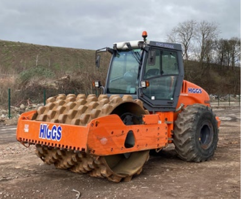
2013 HAMM 3412HT