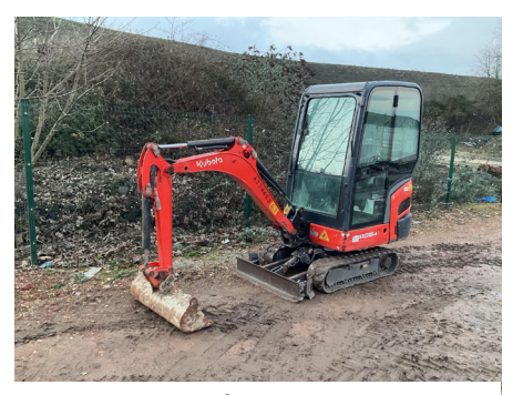
2017 Kubota KX016-4 SOLD FOR: £10,500