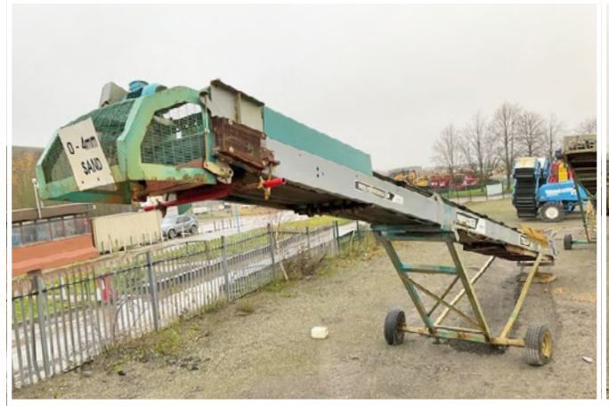
2014 POWERSCREEN T5032 CONVEYOR