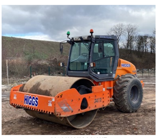
2014 HAMM 3412HT