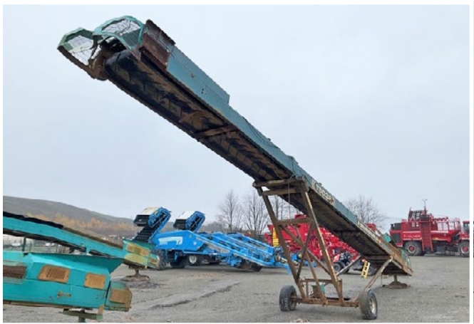
2006 POWERSCREEN T5032 CONVEYOR