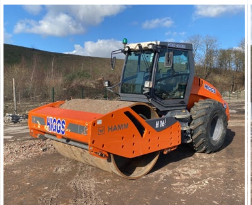
2019 HAMM H16I