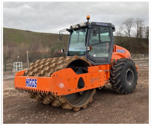
2014 HAMM 3412HT