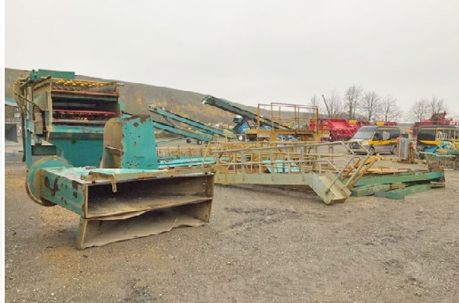
2014 TEREX AGGRESAND 206R-2 WASH PLANT