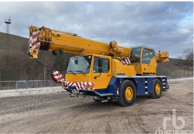
2008 LIEBHERR LTM1040-2.1