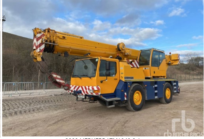
2008 LIEBHERR LTM1040-2.1