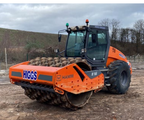
2018 HAMM H16I