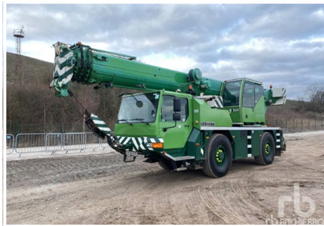
2008 LIEBHERR LTM1040-2.1