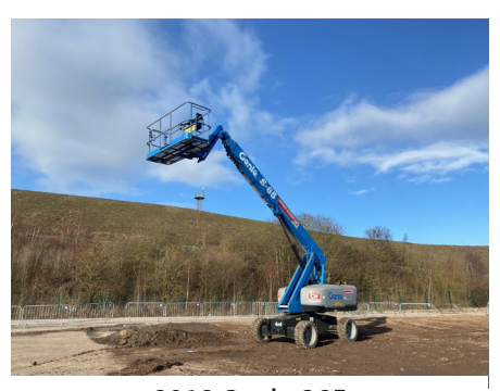
2018 Genie S65 SOLD FOR: £35,000