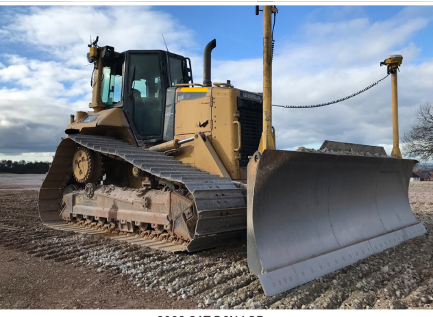
2008 CAT D6N LGP