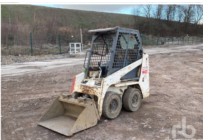
2010 BOBCAT S70