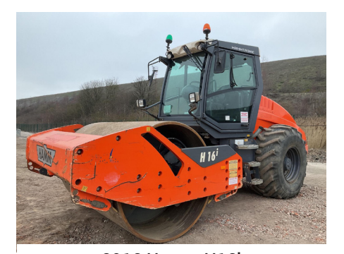
2016 Hamm H16i SOLD FOR: £52,000