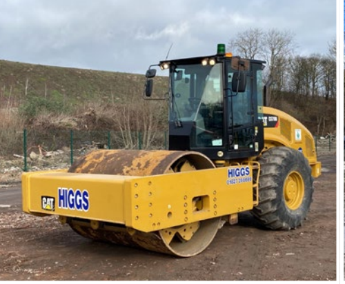
2017 CAT CS78B