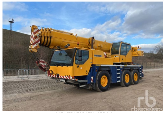
2007 LIEBHERR LTM1055-3.2