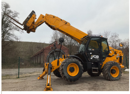
2016 JCB 540-200 SOLD FOR: £46,000