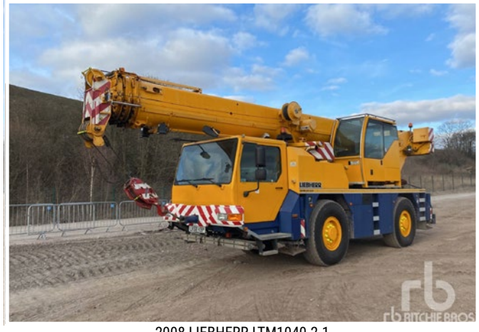
2008 LIEBHERR LTM1040-2.1