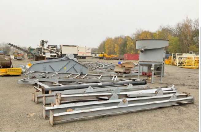
AMP VS-1500 WASH PLANT