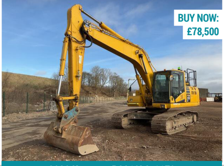
2020 Komatsu PC210LC-11E0