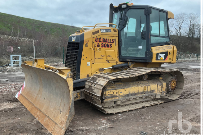
2015 CAT D5K2LGP