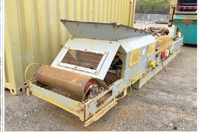
34M CONVEYOR BELT