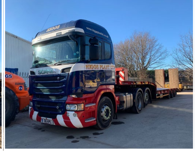
2016 SCANIA R580