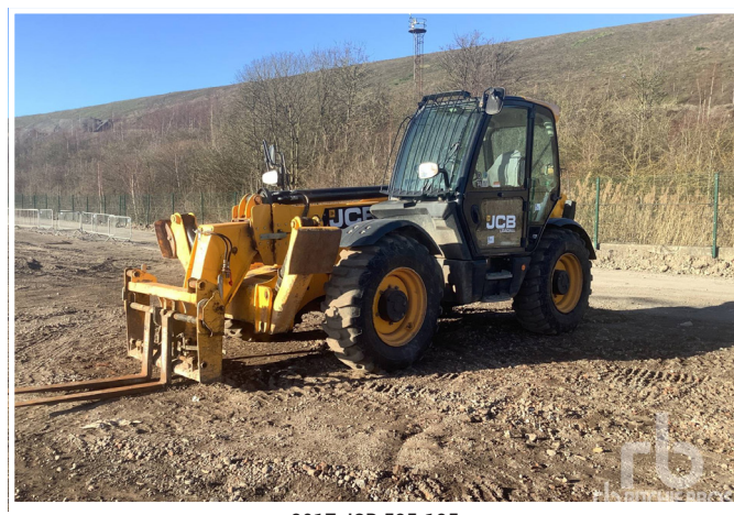
2015 JCB 540-170