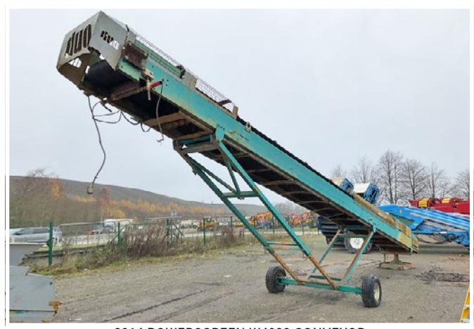
2014 POWERSCREEN W4032 CONVEYOR