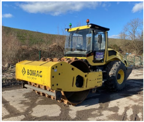
2016 BOMAG BW216DH-5