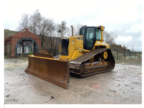
2010 Cat D6N SOLD FOR: £50,000