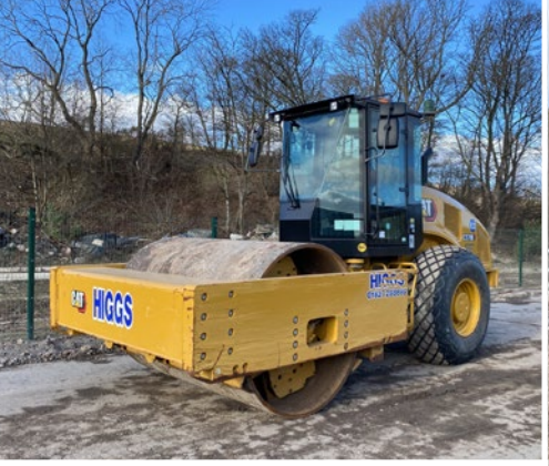
2012 CAT CS78B