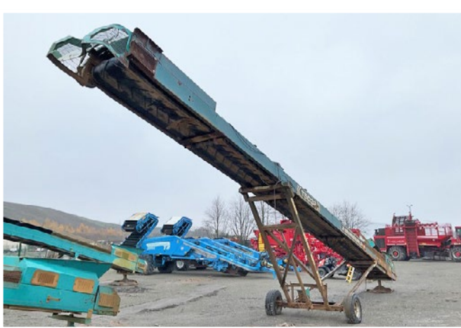
POWERSCREEN T5032 CONVEYOR