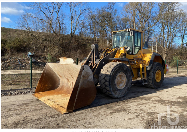
2012 VOLVO L180G