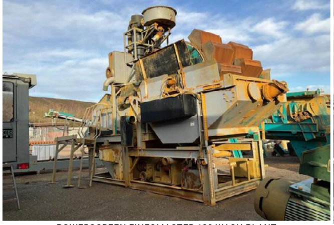
POWERSCREEN FINESMASTER 120 WASH PLANT